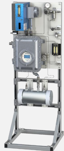
Envent Model 330S-EX with Standard Sample Conditioning and Total Sulfur Oven