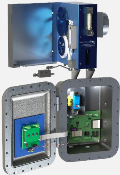
Envent Model 330S-EX Analyzer