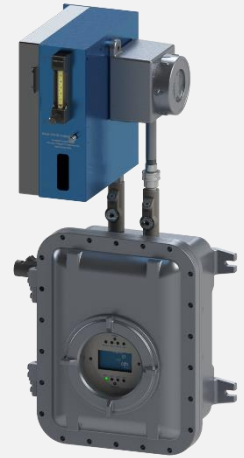
Envent Model 330S-EX H 2 S Analyzer